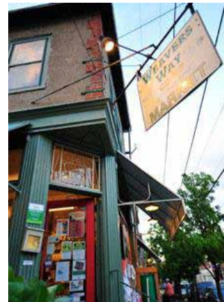
Weavers Way Food Co-op in the heart of Mt. Airy Village