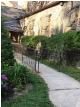
ADA compliant access ramp

© 2017 Summit Presbyterian Church. Availability and rates subject to change, please call office at 215-438-2825 for the most current information.